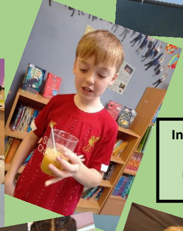
Investigating soluble materials